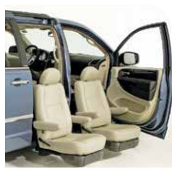
Valet® Signature Seating