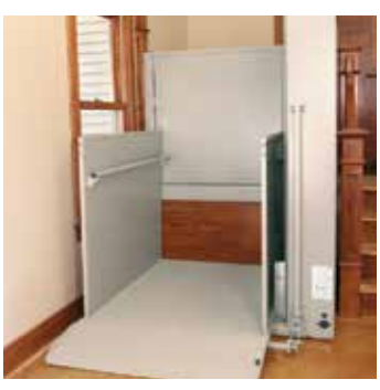
Vertical Platform Lifts